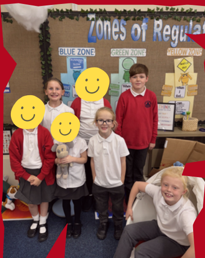
Ministry for Education 25/26