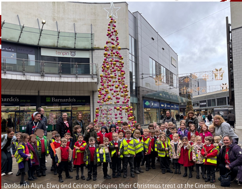
Dosbarth Alyn, Elwy and Ceiriog enjoying their Christmas treat at the Cinema.