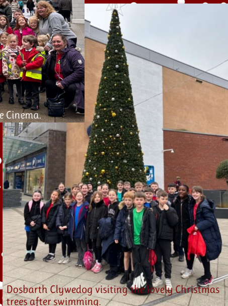
Dosbarth Clywedog visiting the lovely Christmas trees after swimming.