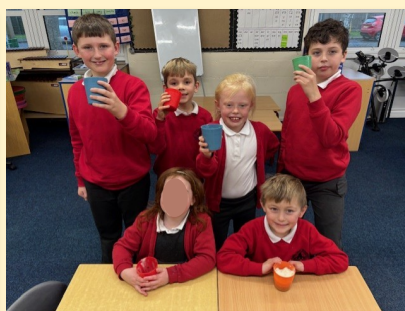
This week's Hot Chocolate with the Headteacher!

A huge thank you to all our parents and carers for signing up and supporting our school through the ASDA Cashpot initiative. Your involvement helps us raise vital funds to enhance learning experiences for our children.