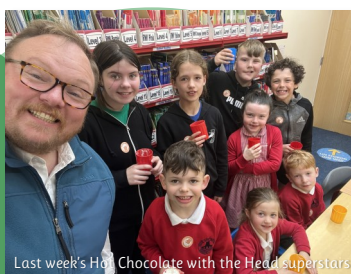
Last week's Ho Chocolate with the Head superstars