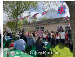
Community Coffee Morning

We would like more events & experiences that bring the local & school community together. We would like to have more opportunities to visit school and spend time with our children.