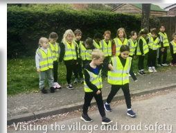
Visiting the village and road safety

We were so pleased with the support from our families who were able to attend the Family Learning-Come and Do sessions. We are planning these in more regularly next year, with the view of offering a 'Parents' Lunch' too.