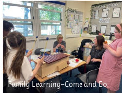
Family Learning-Come and Do