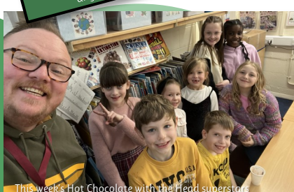
This week's Hot Chocolate with the Head superstars