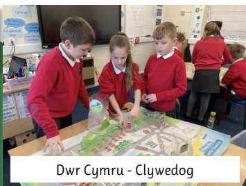
Dwr Cymru - Clywedog