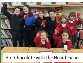
Hot Chocolate with the Headteacher