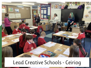
Lead Creative Schools - Ceiriog