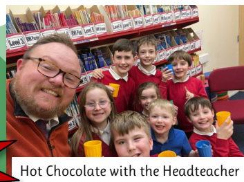
Hot Chocolate with the Headteacher